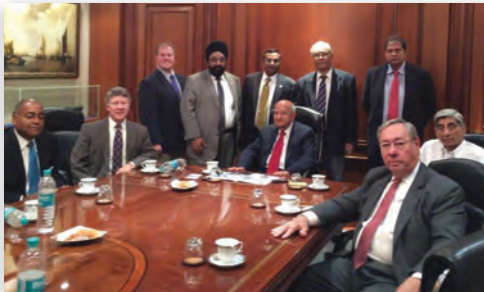
Discussion on Maritime Trade between Houston & India