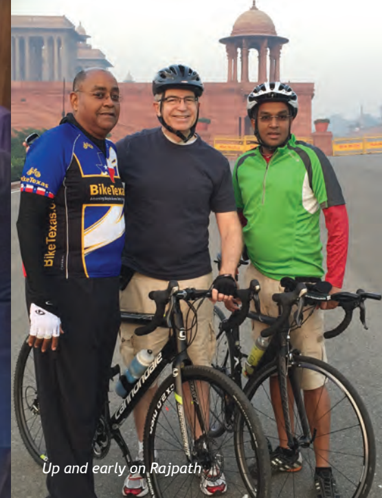
Up and early on Rajpath