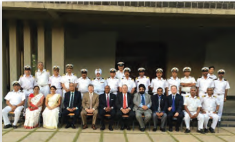
Naval Academy Near Malavli-Pune