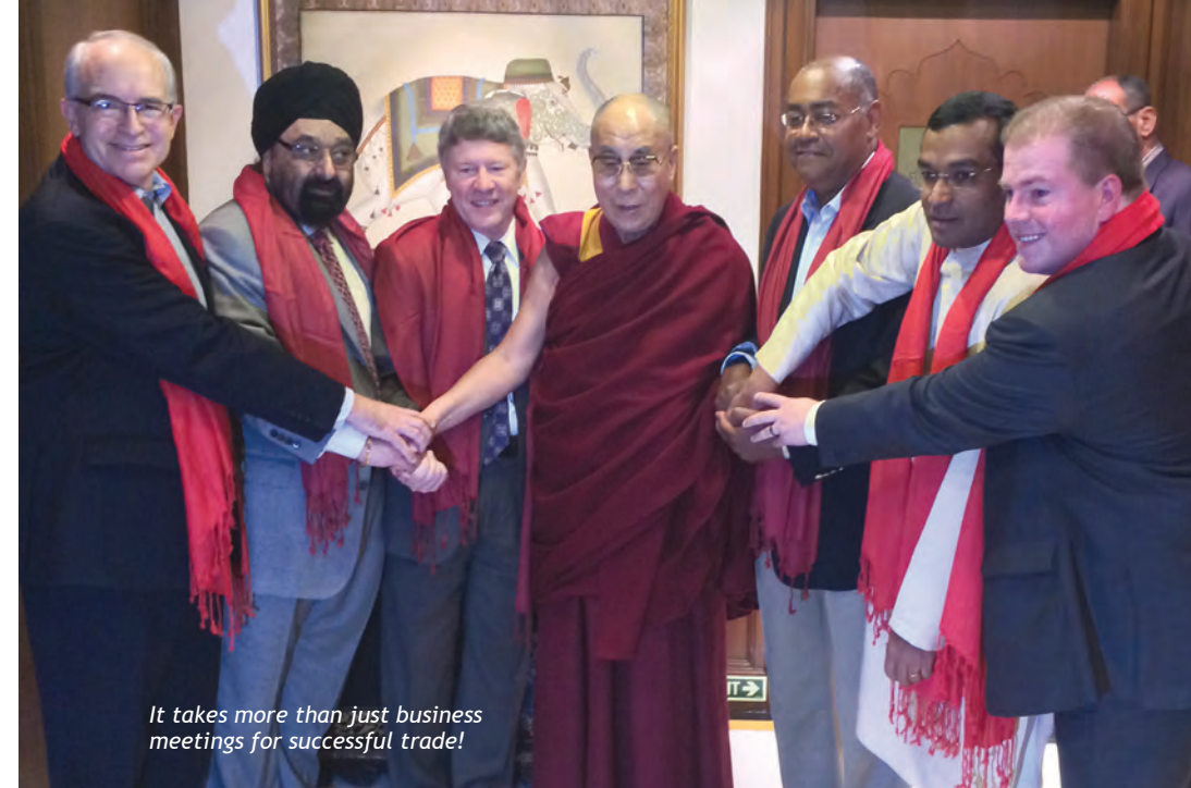
It takes more than just business meetings for successful trade!