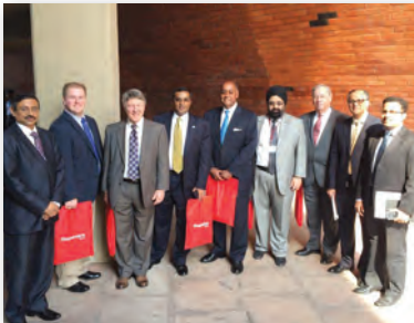
Encouraging expansion and investment in the Greater Houston region with Mahindra & Mahindra