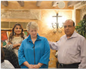
IACCGH hosts a Welcome Reception for Mayor Annise Parker and the delegates at Khyber, Mumbai