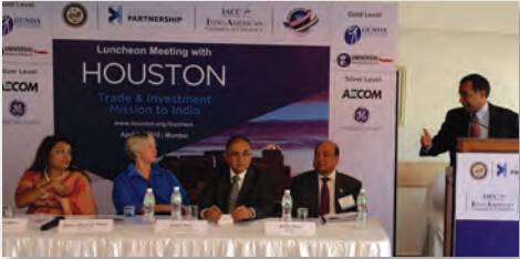
IACC Mumbai hosts Houston delegation at Cricket Club of India