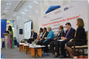
Delegation showcases investment opportunities in Houston to members of the World Trade Center in Mumbai