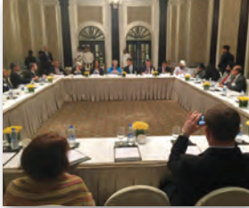
The Consul General of Mumbai briefs the delegation on India's political and economic developments