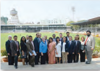
The delegation visits the Wankhede Stadium in Mumbai