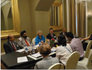
Mayor Annise Parker and members of the delegation speaking to the Indian media