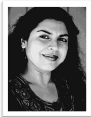
Chitra Divakaruni Celebrity Novelist, Writer, Educator