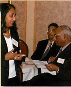
Joint seminar with Indian Doctors Association featuring American Cancer Society