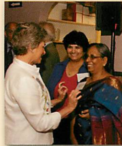
Launch of Annual Reception for Indian doctors visiting MD Anderson