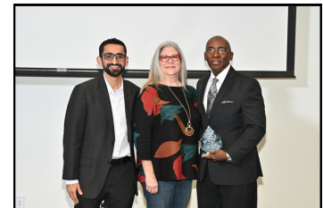
Innowatts Honored as the Technology firm of the Year