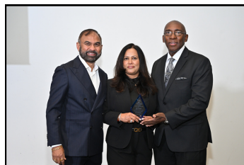
R & S Oilfield Honored as the Distributor of the Year