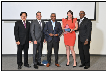
Wallis Bank honored with the Access to Capital Award

Indo-American Chamber of Commerce of Greater Houston is proud to announce that members, Wallis Bank, MD & Associates, R& S Oilfield, Innowatts, Centerpoint Energy were honored at the 32nd Annual Greater Houston Business Procurement Forum.