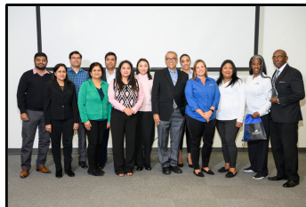
MD & Associates Honored as the Professional Services Firm of the Year