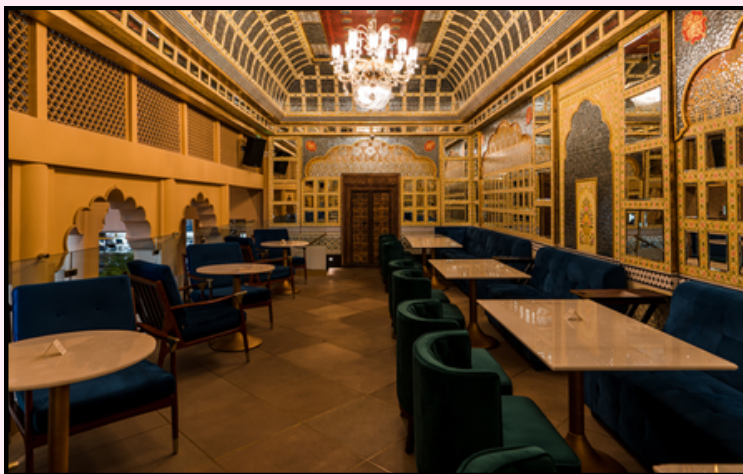
Interiors of Musaafer